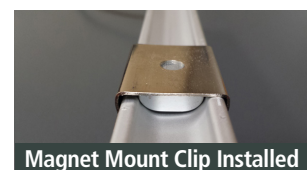
Magnet Mount Clip Installed

1 Source LED • 622 Pinnacle Place, Livermore CA 94550 Toll Free 888.527.7660 • Sales@1SourceLED.com • 1SourceLED.com