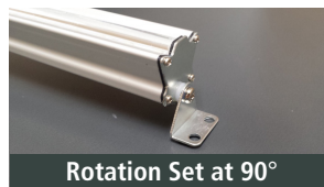
Rotation Set at 90°