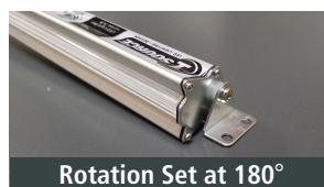
Rotation Set at 180°