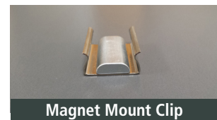
Magnet Mount Clip