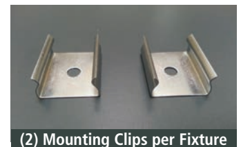
(2) Mounting Clips per Fixture

Installation crews have the option to use EITHER the Bracket End Plates OR Fixture Clips when mounting fixtures to case mullions. 1 Source recommends installing at least one (1) screw at either end Bracket End Plate to secure fixture and prevent fixture from sliding down mounting clips upon door open and closure.