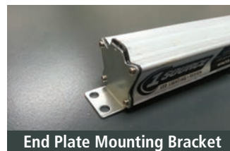
End Plate Mounting Bracket

All Door Configuration Fixtures Include Bracket End Plates and Qty. 2 Fixture Mounting Clips As Pictured Below: