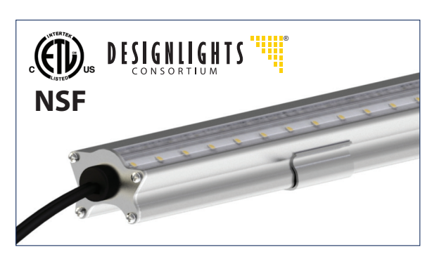
Included Hardware: (2) fixture mounting clips as applicable