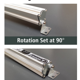
(CANOPY) Rotating Bracket Mount

All 3LB fixtures should be ordered by model number with install application (CANOPY) or (SHELF) . All (CANOPY) fixtures are equipped with ROTATING FIELD ADJUSTABLE MOUNTING BRACKETS. All (SHELF) fixtures are equipped with Qty. 2 each MAGNETS and Qty. 2 each MOUNTING CLIPS. MAGNETS can be removed if not needed.